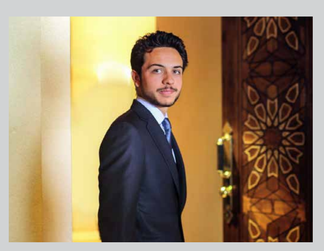
HRH Crown Prince Al-Hussein bin Abdullah II